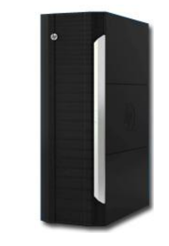
Figure 2: The HP Intelligent Series Rack has industry-leading airflow efficiency.

When you connect these components as shown in Figure 3, the iPDU automatically detects and communicates with each server's iLO Management Engine before the servers are powered on. The